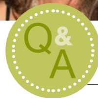
SANDY DE BRUIN Country Living