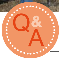
GREGOR BREMER Soda Designs